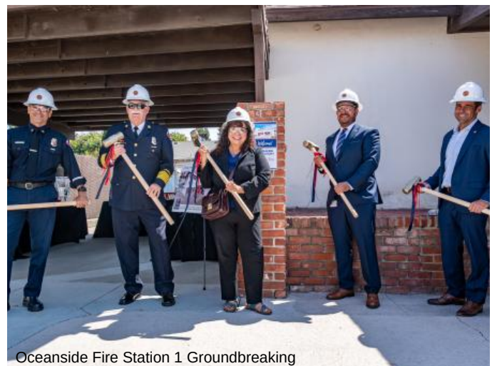
Oceanside Fire Station 1 Groundbreaking

While Oceanside's booming tourism economy is leading to a growing population, Latitude 33 is working closely Latitude 33 is working closely with city leaders to create infrastructure for today and tomorrow. With new fire stations, modernized schools, new assisted living, and essential green space, Oceanside will continue to be an attractive destination and a flourishing community.