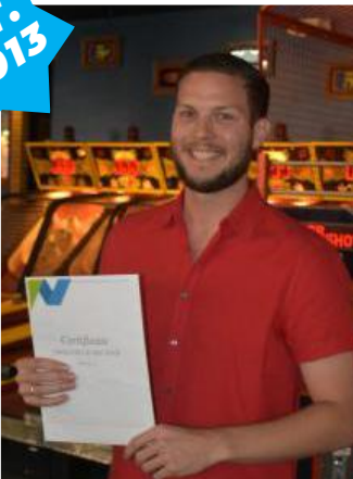
Photo taken in 2018